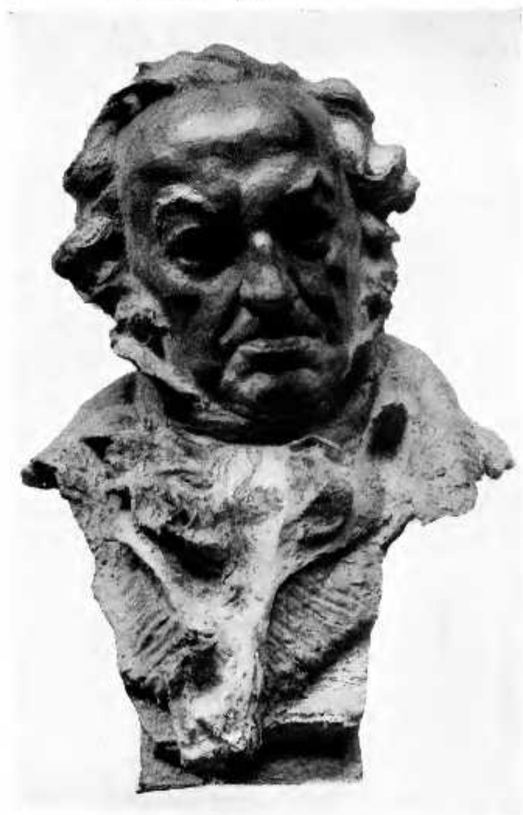
PORTRAIT BUST OF FRANCISCO GOYA By Mariano Benlliure y Gil