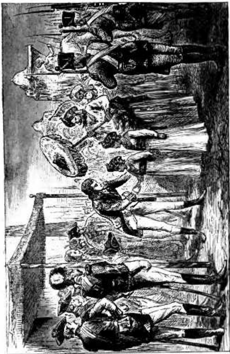
"THE LITTLE HOSTAGES WERE RECEIVED WITH MUCH DISTINCTION" (P. 51).