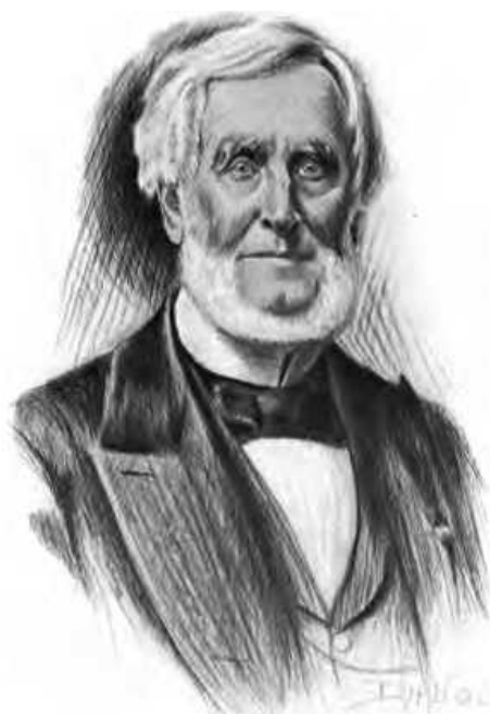
DRAWN FROM PHOTOGRAPH BY HERMANN QUINCY, ILL.