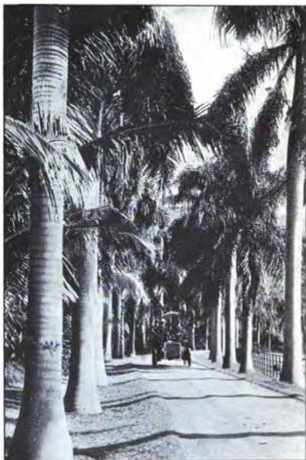
ROYAL PALM AVENUE IN 1911, HONOLULU