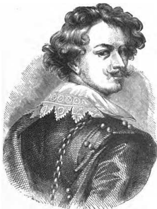
SIR ANTONY VAN DYCK.

From the portrait by himself in the Uffizi Gallery, Florence.