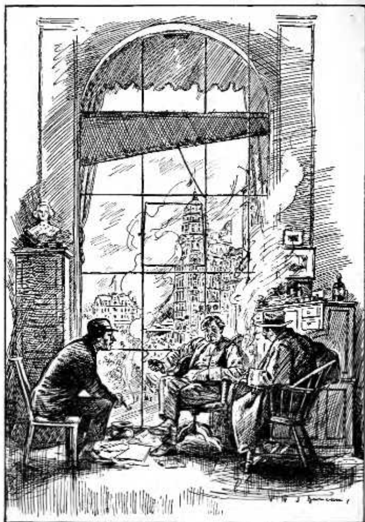
Tales from a Rolltop Desk