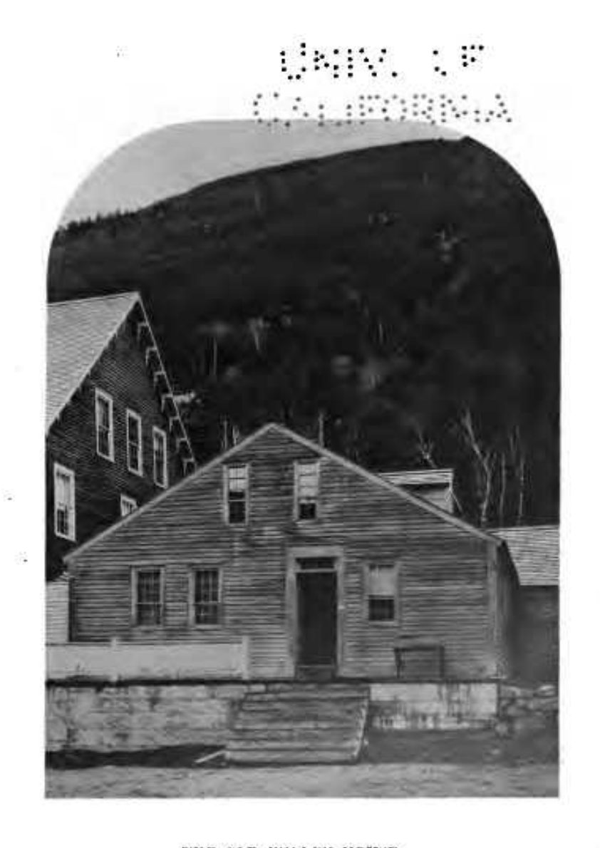
THE OLD WILLEY HOUSE.