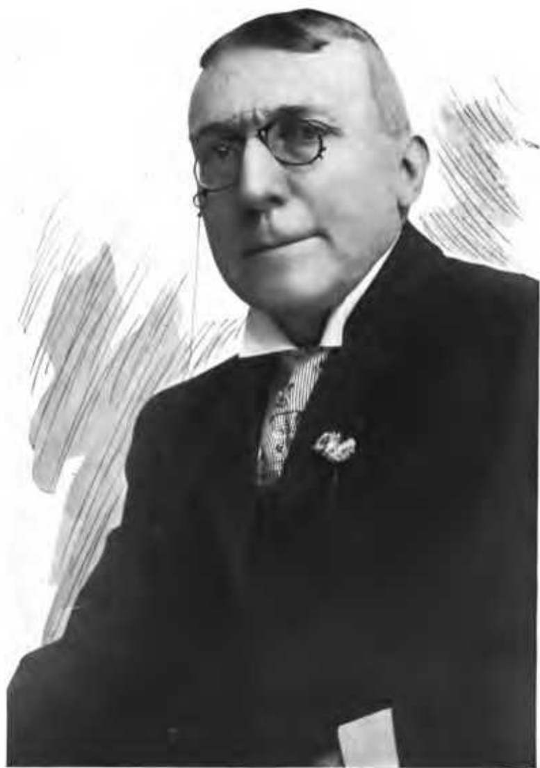
JAMES WHITCOMB RILEY The People's Poet