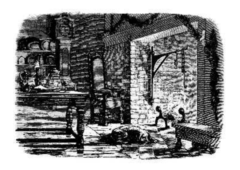
THE HANGING OF THE CRANE.