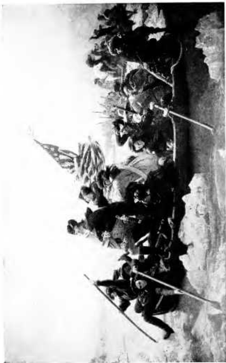
WASHINGTON CROSSING THE DELAWARE