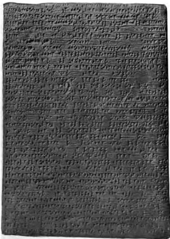
Limestone tablet inscribed with the Annals of Tukulti-Ninib I, King of Assyria. [Brit. Mus. No. 98494, Obverse.]