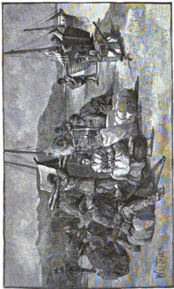
LANDING OF THE SURVEYORS.