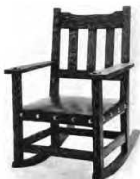
Chair Presented to President Roosevelt