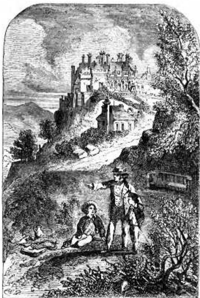
THE PICNIC. See page 133.