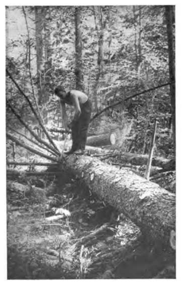
LUNGERING, A PART OF THE PRACTICE OF FORESTRY.