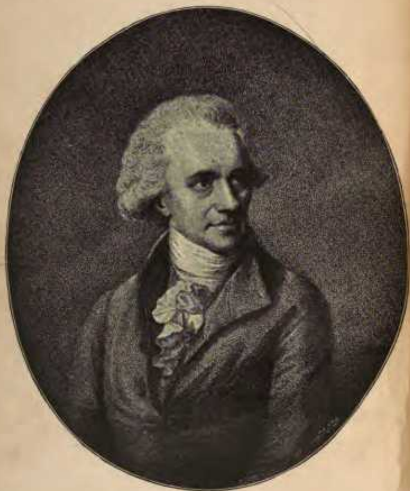
SIR WILLIAM HERSCHEL.