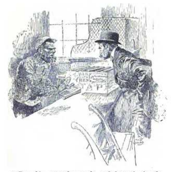
" Pets thim animals may be, an' domestic they be, but pigs, I'm blame sure they do be"