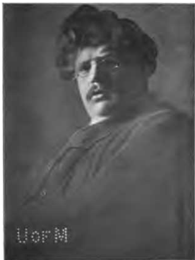
GILBERT KEITH CHESTERTON