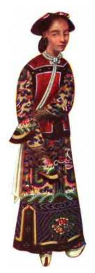
THE CELESTIAL FEMALE