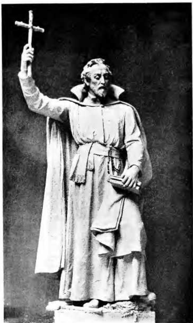
ISAAC JOGUES, S.J.