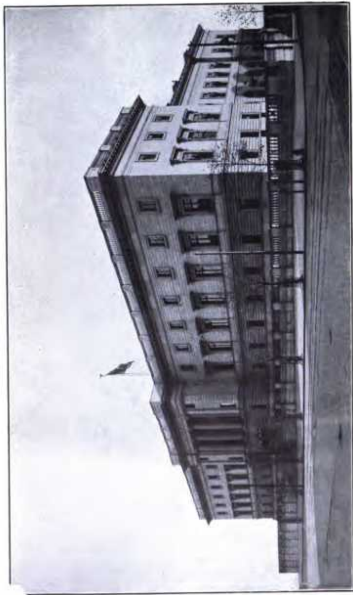
UNITED STATES MINT, PHILADELPHIA, PA.