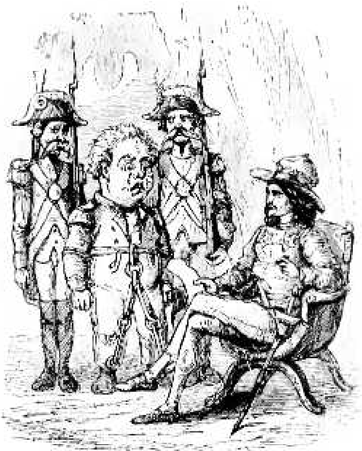
POOR RULBO IS ORDERED FOR EXECUTION