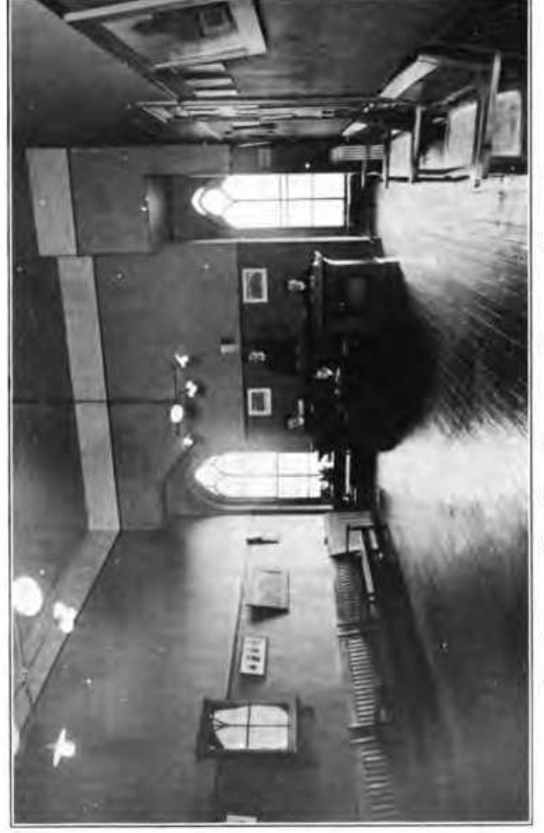
THE CASE ON THE LEFT WALL CONTAINS THE CAST OF THE ROSETTA STONE