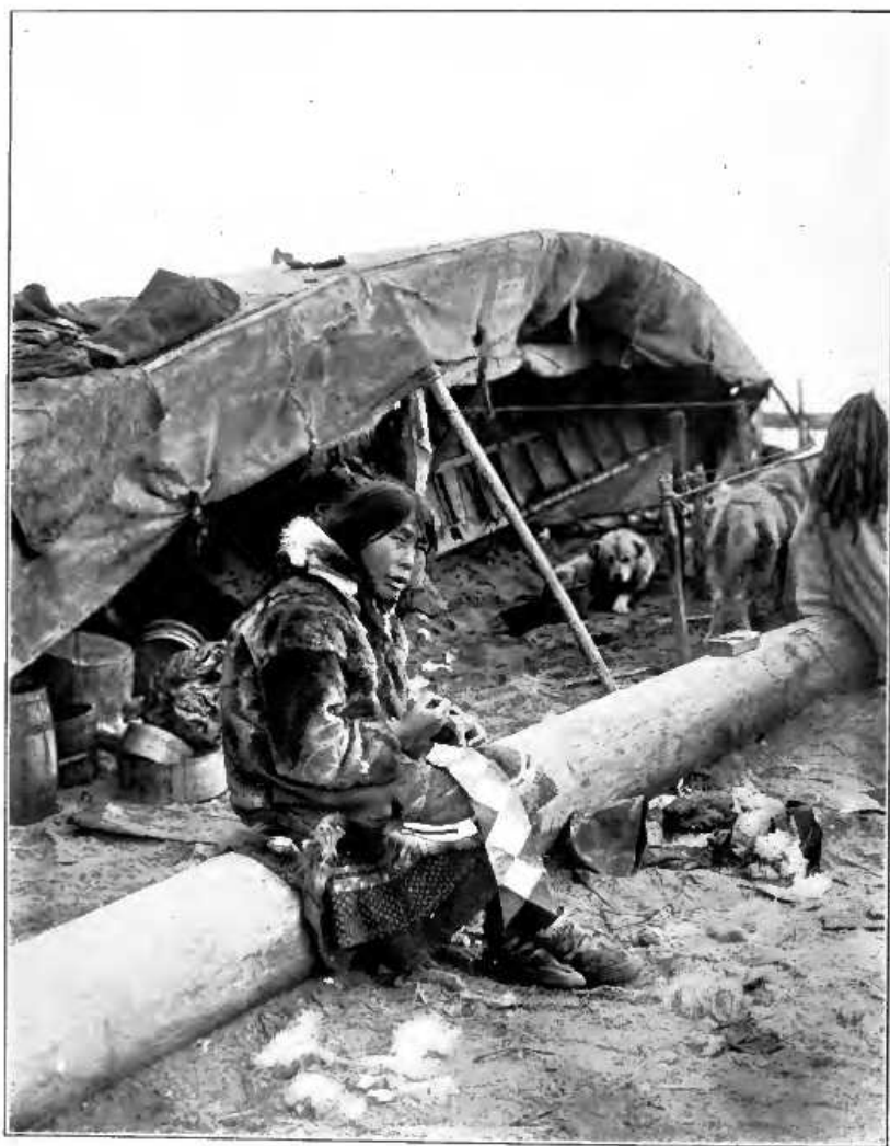
NATIVE ALASKAN NEEDLEWOMAN.