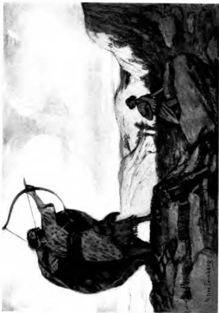
THE PRINCE SHOT THE ARROWS BEYOND HIM (page 137)