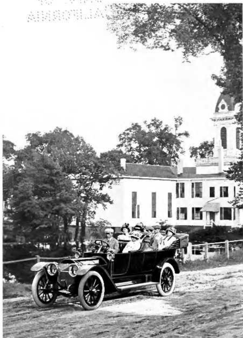
Six-Cylinder, Seven-Passenger Touring Car