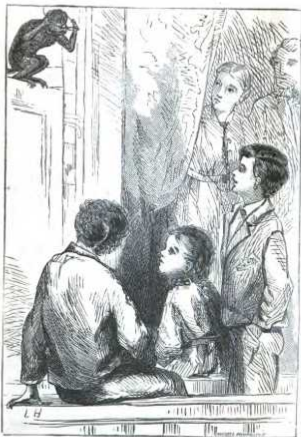
FROLL'S ANTICS. — Page 54.