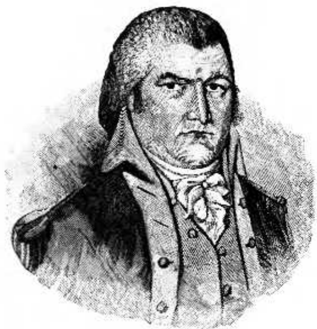
GENERAL MOSES CLEVELAND.