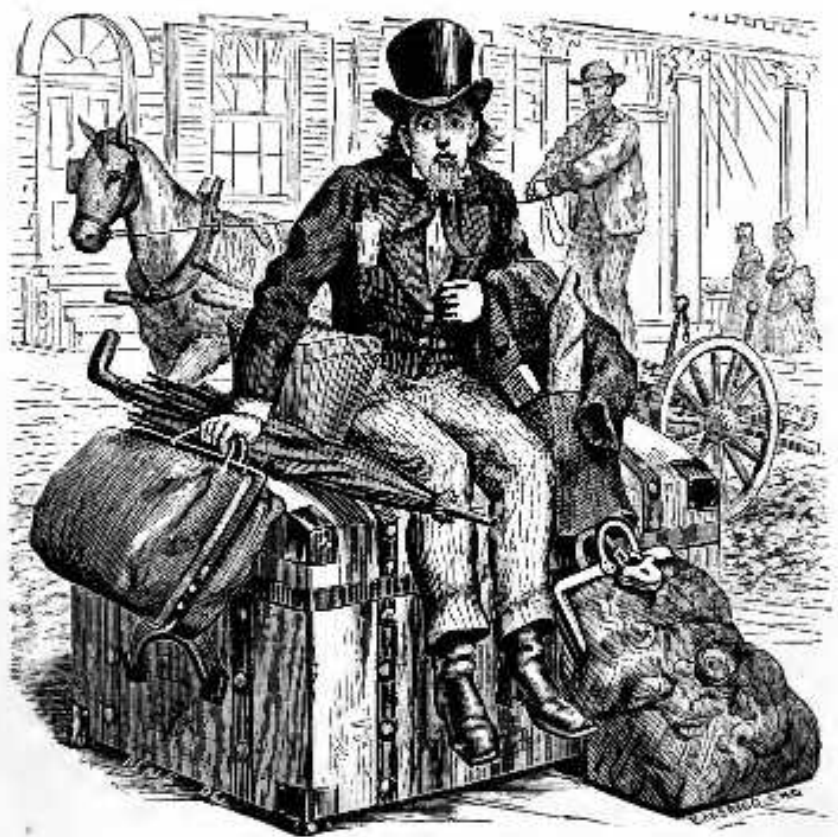
THE GREEN TRAVELER.