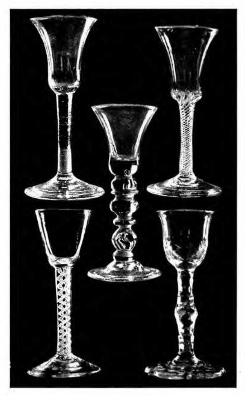
EIGHTEENTH CENTURY GLASSES

Typical Examples of the Five Main Groups,