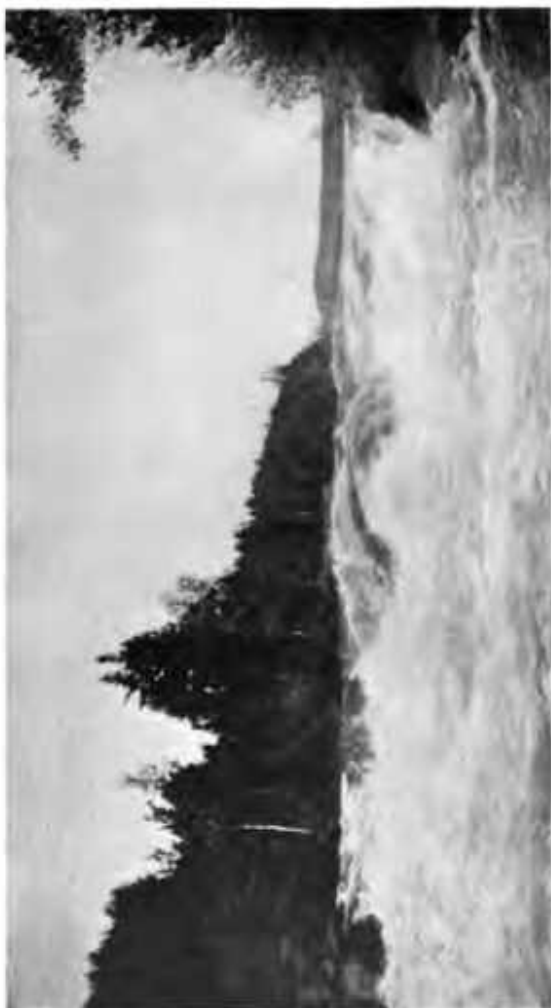
UPPER CAMERON RAPIDS.