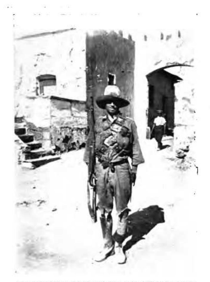
WHAT THE NATAL CARBINEERS LOOK LIKE AT GIBEON—SENTRY OUTSIDE THE HOSPITAL.