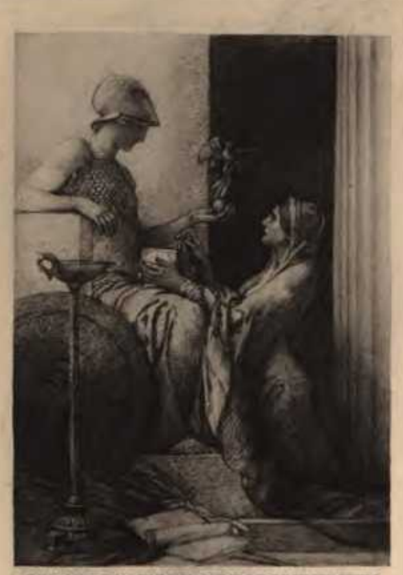
LELAND STANFORD JVNIOR VNIVERSITY