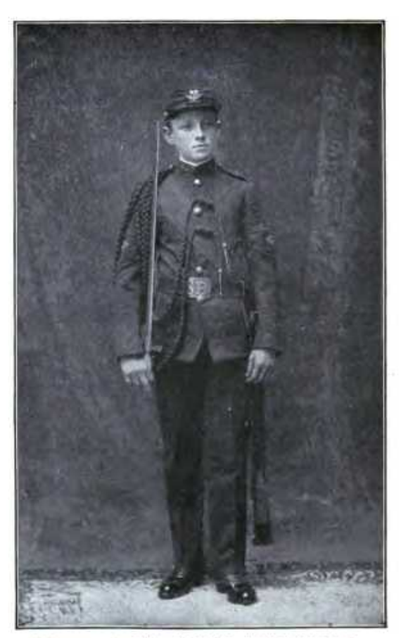
DRUM MAJOR, PUBLIC SCHOOL, NEW YORK CITY.