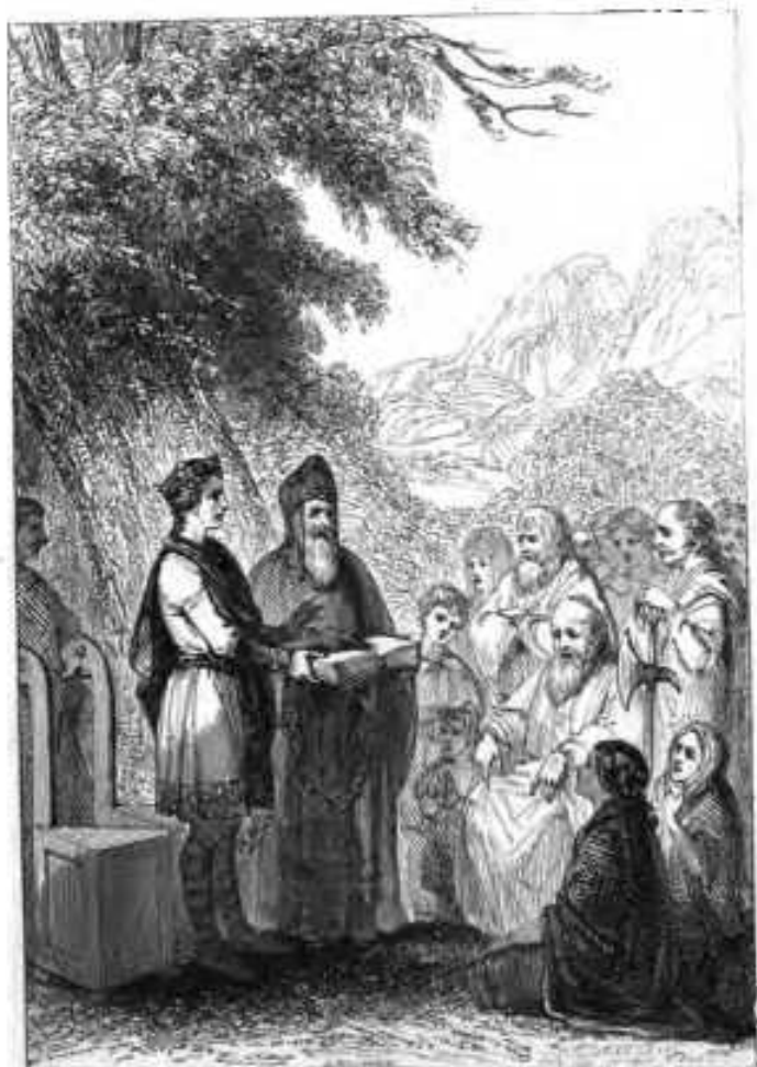
'THE KING WAS HIS INTERPRETER.'--