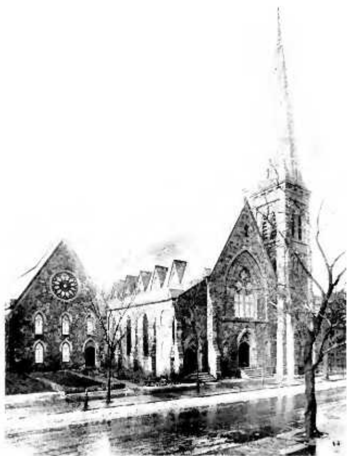
THE PRESENT CHURCH BUILDING