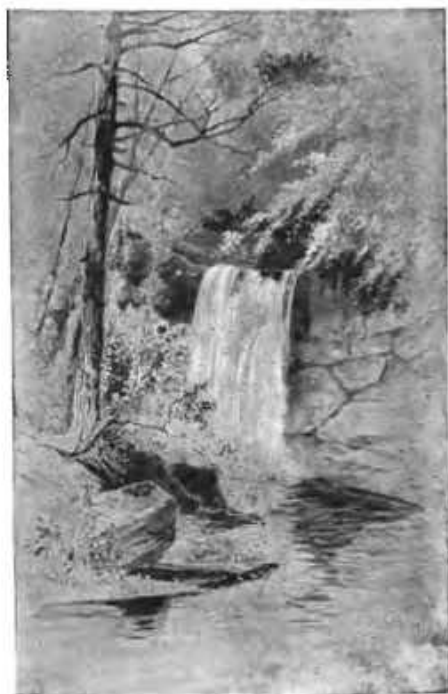
MINNEHAHA, PIKE'S PEAK TRAIL.