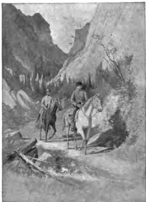
ON THE PINE'S PEAK TRAIL.

THE NEW YORK PUBLIC LIBRARY 110961A ASTOR, LENOX AND TILDEN FOUNDATIONS R 1922 L