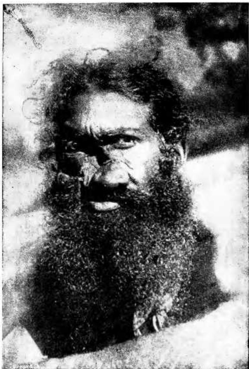
FACE OF A VEDDAH MAULED BY A BEAR.