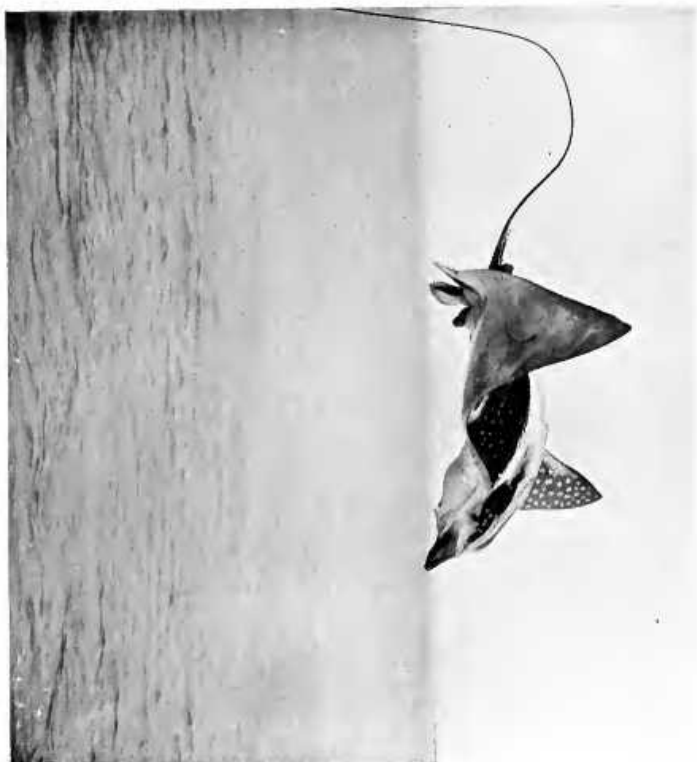
A WHIP RAY LEAPING.