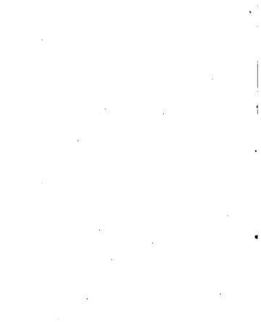
Figure 1. Distribution of the number of nodes in a network.