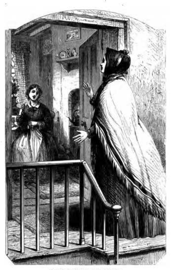
THE BRIDE'S NEW HOME.

--- "It is a real pleasure to me to see you in such a home of your own." Page 3.