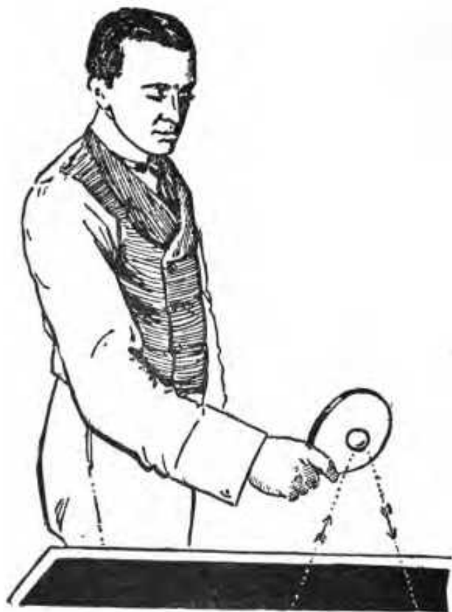
BACK-HAND DRIVE FROM RIGHT TO LEFT.