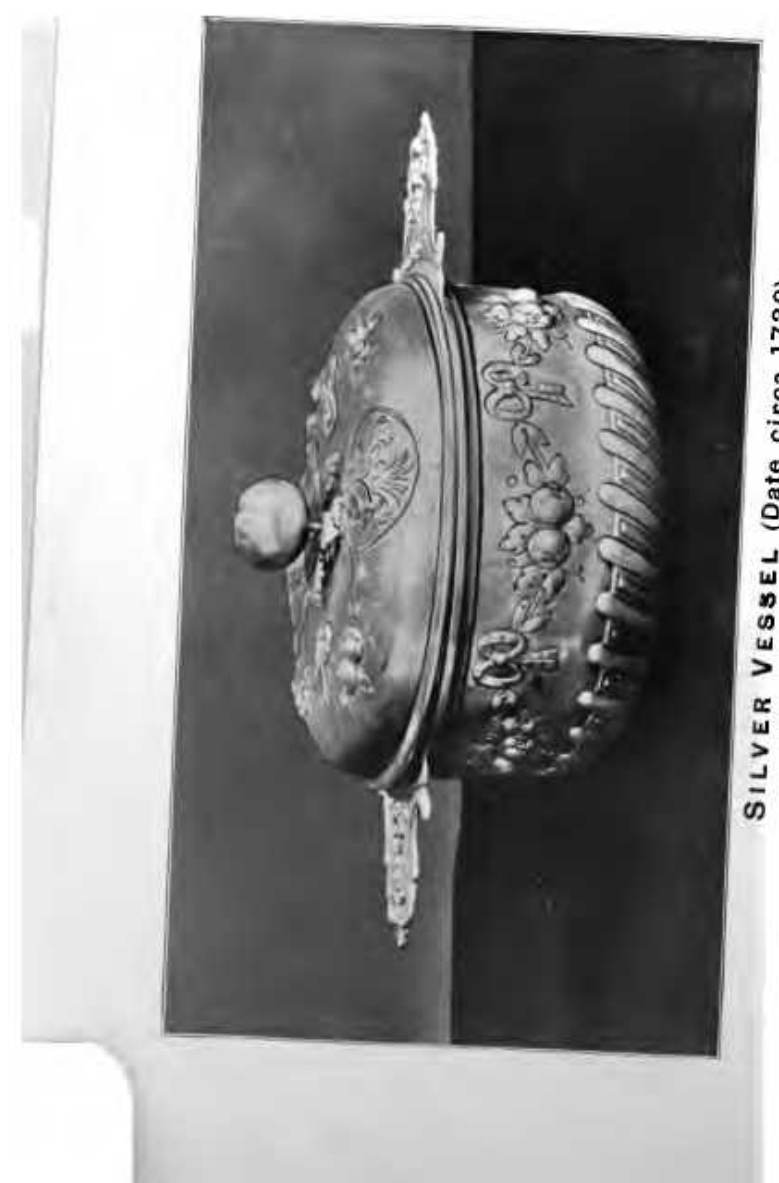
SILVER VESSEL (Date circa 1730), BELONGING TO MAJOR-GENERAL SOTHERY.