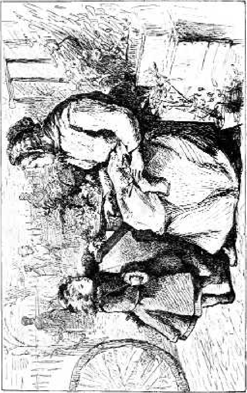
THE LOST FLIN. — Page 105.