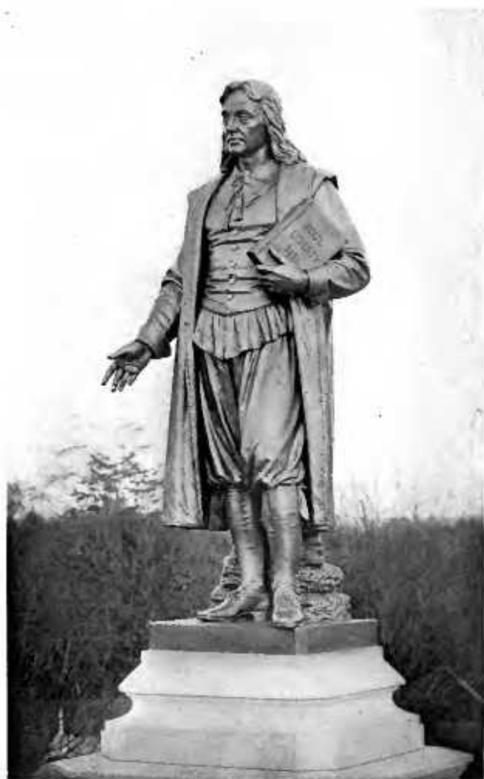
Detail of Roger Williams Statue, Roger Williams Park, Providence