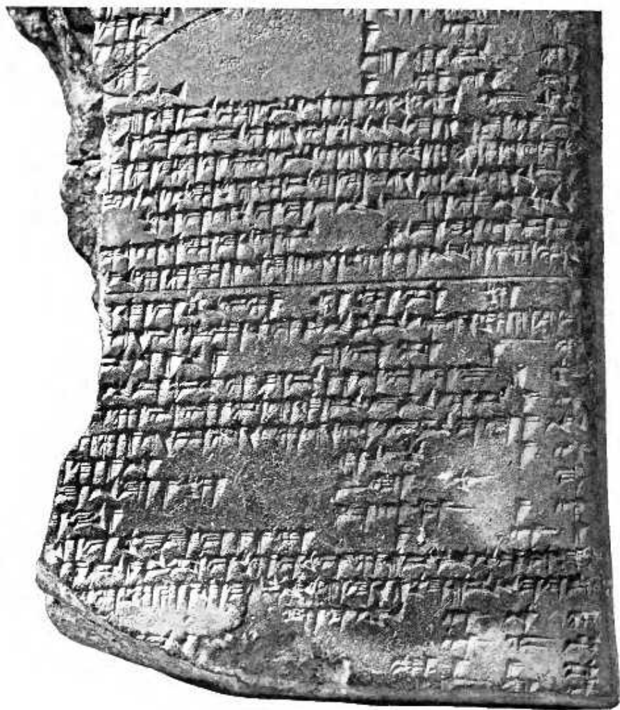
Part of the tablet supposed to contain a mention of the Babylonian Garden of Eden (K. 111).