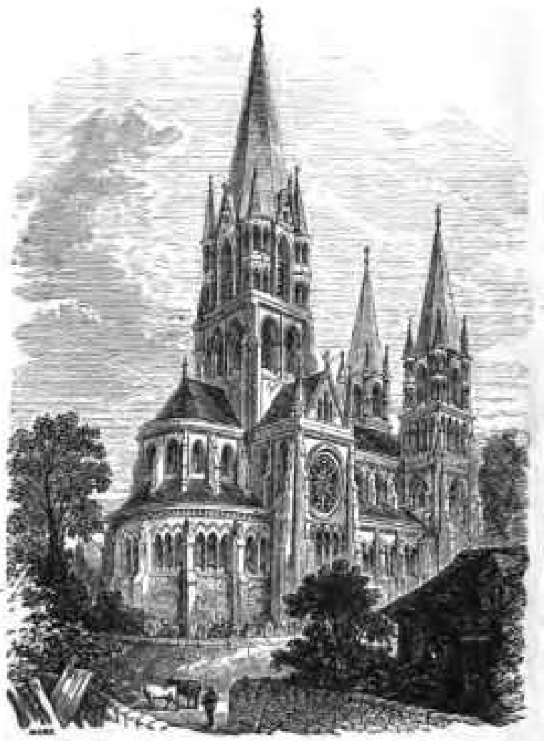
CATHEDRAL OF S. FIN BARRE, CORK.