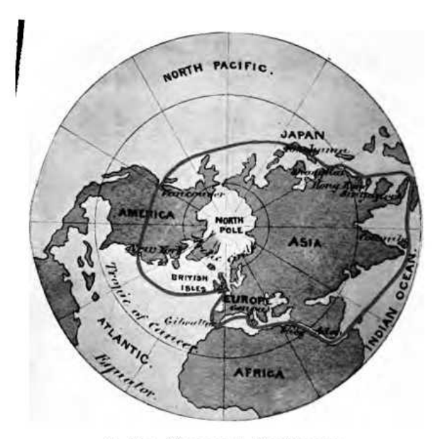
1-THE NORTHERN HEMISPHERE.

This Sketch Map of the Northern Hemisphere shows the course of my journey (indicated by the dotted line) from England by the Eastward route to Japan, returning by America and thus making the circuit of the world.