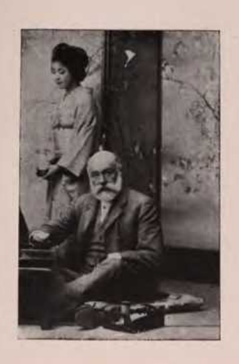
To friends with whom I have travelled or have met in various parts of the world, whose pleasant company and many acts of kindness still live in the grateful memory of the author.