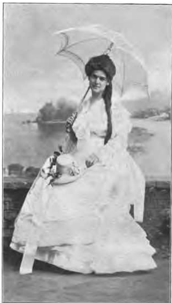
A DAUGHTER OF LIBERTY.