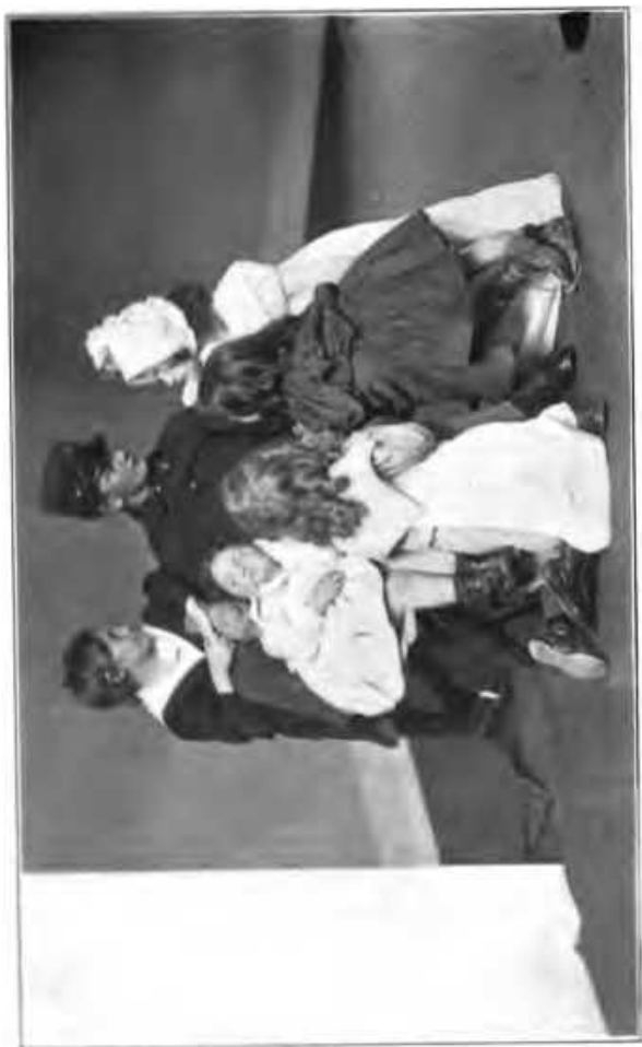
"The Children Demanded a Story" (see page 9).